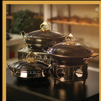
Banquet - Buffet Furniture & Live Station

From elegant chafing dishes to versatile food displays and catering accessories, our buffetware collection is designed to enhance any dining occasion. Whether you're hosting a luxury event, a corporate gathering, or a casual brunch, we provide the tools you need to impress your guests and streamline your service.