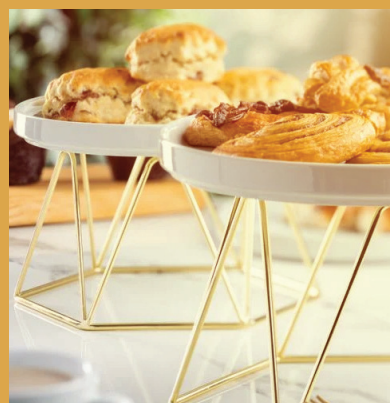
Buffet Riser & Displays