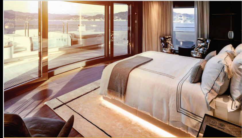
Rooms & FOH