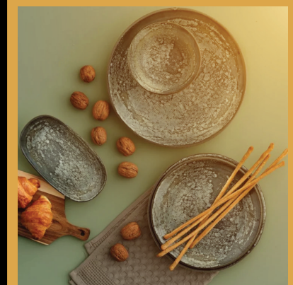
Platters & Bowl