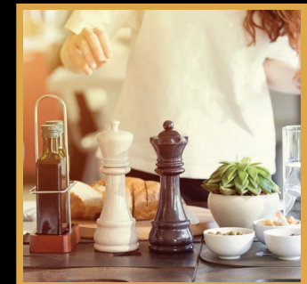
Salt & Pepper Mills