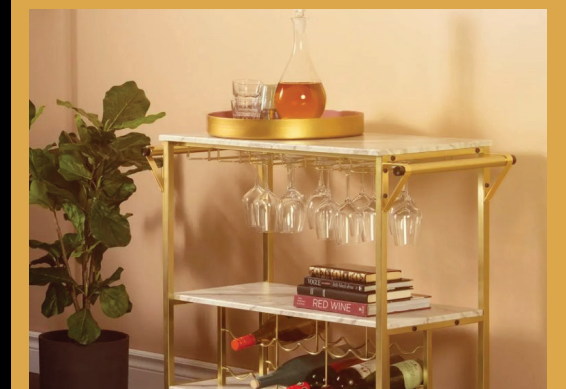
FOH & Trolleys