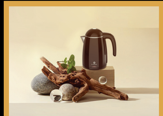
Guest Room Amenities & Electronics

Our curated collection includes everything from high-quality bed linens and plush towels to cutting -edge in-room electronics and convenient service trolleys, all designed to enhance the comfort and satisfaction of your guests. With a focus on durability, style, and functionality, our products help elevate your establishment's ambiance and service standards. Explore our offerings and create a welcoming, unforgettable experience for your guests.