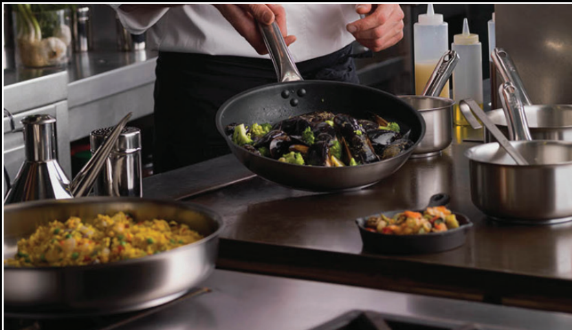
BOH & Kitchenware