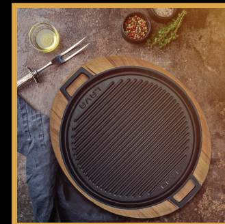
Wood & Cast Iron

Ultimately, investing in exceptional tabletop items helps create memorable experiences that keep customers coming back.