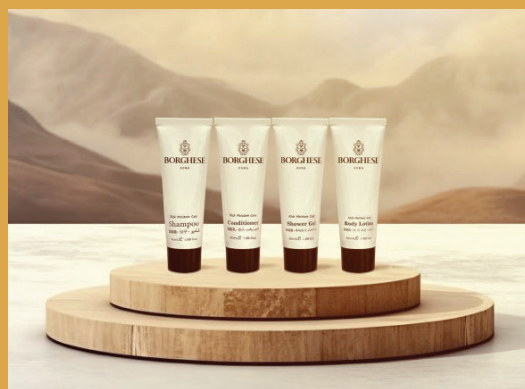
Dry & Wet Amenities